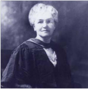
ELLEN SPENCER MUSSEY