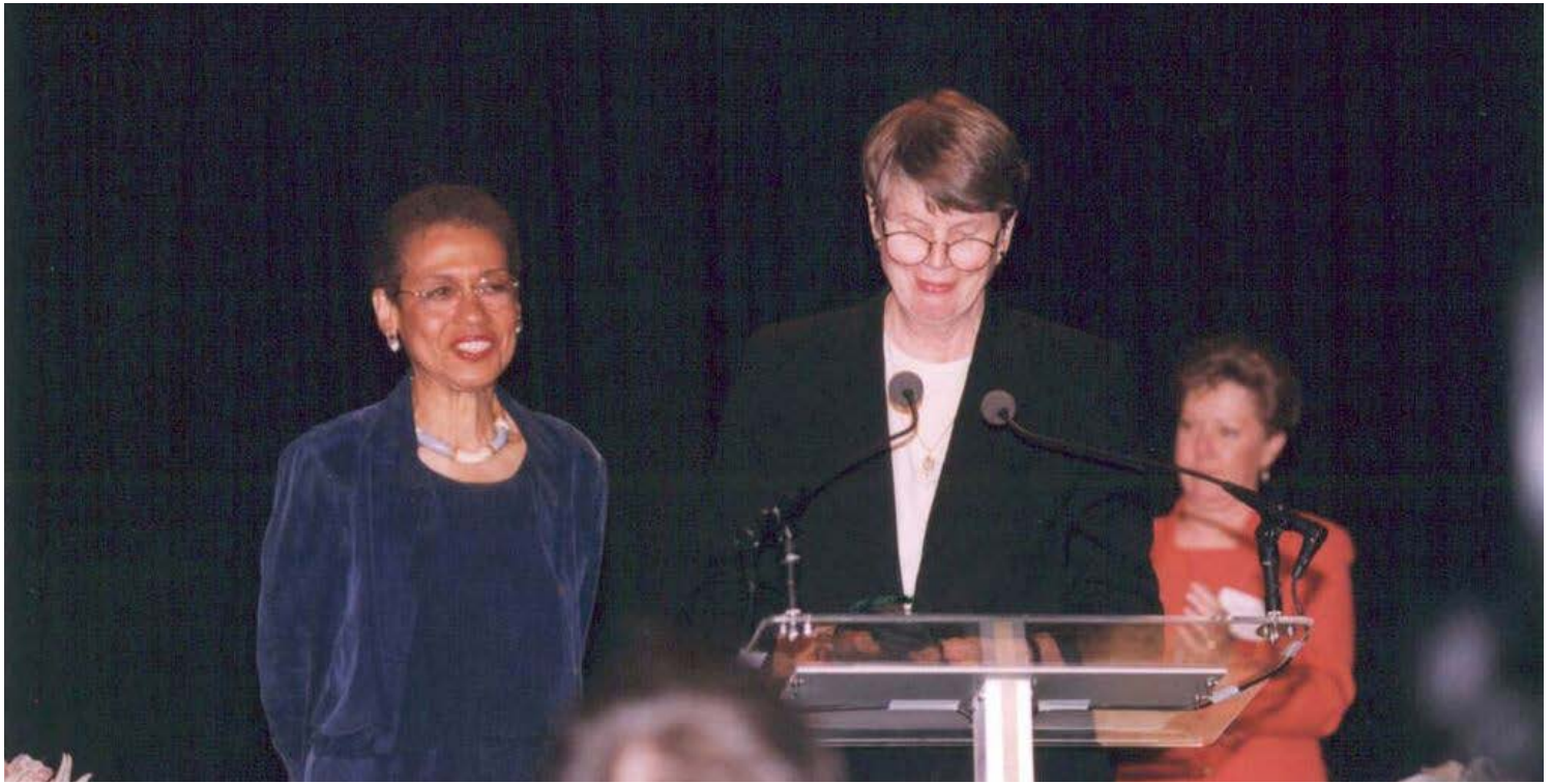
Congresswomen Eleanor Holmes Norton with Attorney General Janet Reno at the 1996 Annual Dinner