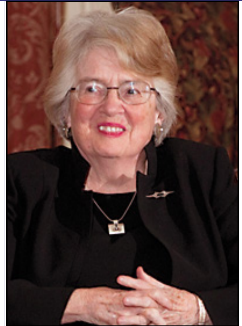
The Honorable Patricia McGowan Wald

Judge Wald will receive the award along with 15 other recipients, including Ben Bradlee, President Bill Clinton, Loretta Lynn, Sally Ride, Gloria Steinem, and Oprah Winfrey.