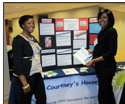
Representatives from Courtney's House shared information about their programs with attendees.