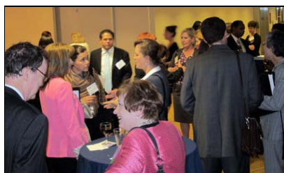
The event was a great networking opportunity for the 120 people who attended.