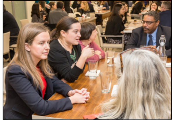
WBA's Seventh Annual Mentoring Supper