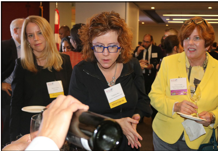
Representatives from Dean & DeLuca presented wine and pairings